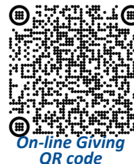
On-line Giving QR code

"Make a Change" Campaign for LifeLine Children's Service ongoing through Father's Day! Fill a bottle and take another one!