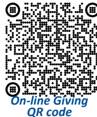
On-line Giving QR code

"Make a Change" Campaign begins today through Father's Day! Grab a bottle and fill with change for Lifeline Women's Resource Center